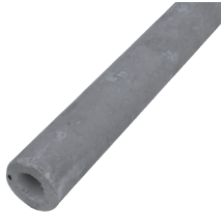
Fibre concrete tube for tie rod 15mm