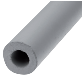
Fibre concrete tube with fix length, for tie rod 15/17mm