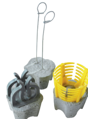
Cast concrete single spacer „Four feet“

..KK - with plastic clamp ..FB - with shuttlecock clip ..O - with eye hook