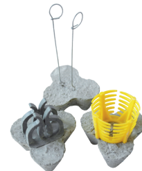
Cast concrete single spacer „Three feet“

..KK - with plastic clamp ..FB - with shuttlecock clip ..O - with eye hook