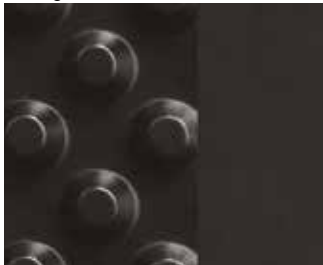
Nevobahn® with sliding film

Developed for blinding beds cost- and timesaving