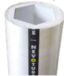
Column formwork Nevotube® „Hexagon“

If self-compacting concrete is used, the casting speeds have to be halved.