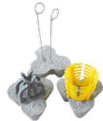
Cast concrete single spacer „Three feet“

..KK - with plastic clamp ..FB - with shuttlecock clip ..O - with eye hook