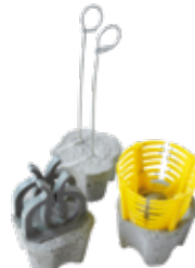
Cast concrete single spacer „Four feet“

..KK - with plastic clamp ..FB - with shuttlecock clip ..O - with eye hook