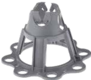
Spacer „with baseplate“