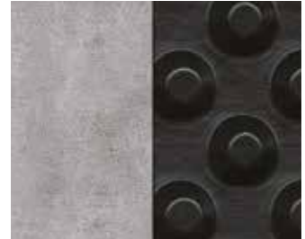
Nevobahn with drainage textile