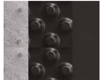
Nevobahn with drainage textile and sliding film