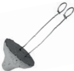
Cast concrete single spacer „CIRCULAR SHAPE“ with eye hook

Approved according to DBV specification „Abstandhalter“ DBV - c - L2/F/T/A