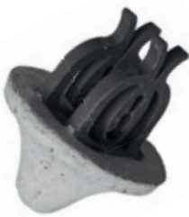
Cast concrete single spacer „CIRCULAR SHAPE“ with plastic clamp

Approved according to DBV specification „Abstandhalter“ DBV - c - L2/F/T/A