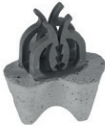
Cast concrete single spacer „THREE FEET“ with plastic clamp

Approved according to DBV specification „Abstandhalter“ DBV - c - L2/F/T/A