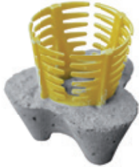
Cast concrete single spacer „THREE FEET“ with shuttlecock clip