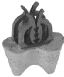
Cast concrete single spacer „THREE FEET“ with plastic clamp

Approved according to DBV specification „Abstandhalter“ DBV - c - L2/F/T/A