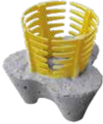
Cast concrete single spacer „THREE FEET“ with shuttlecock clip