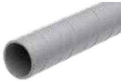
Distance sleeve with a roughened surface