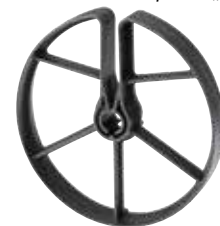
Wheel spacer „Piling“