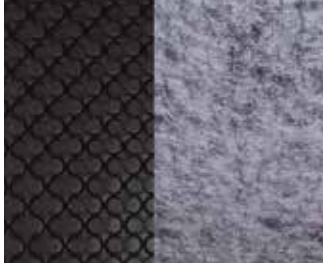
Nevobahn - 2+2 GEO with drainage textile