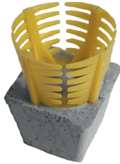
Cast concrete single spacer „SQUARE SHAPE“ with shuttlecock clip