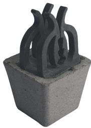
Cast concrete single spacer „SQUARE SHAPE“ with plastic clamp

Approved according to DBV specification „Abstandhalter“ DBV - c - L2/F/T/A