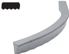
Fibre concrete spacer „Bow with burls“

Approved according to DBV specification „Abstandhalter“ DBV - c - L2/F/T/A