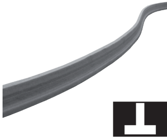
Fibre concrete spacer „T-Snake“