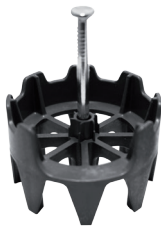
Excenter hollow with nail